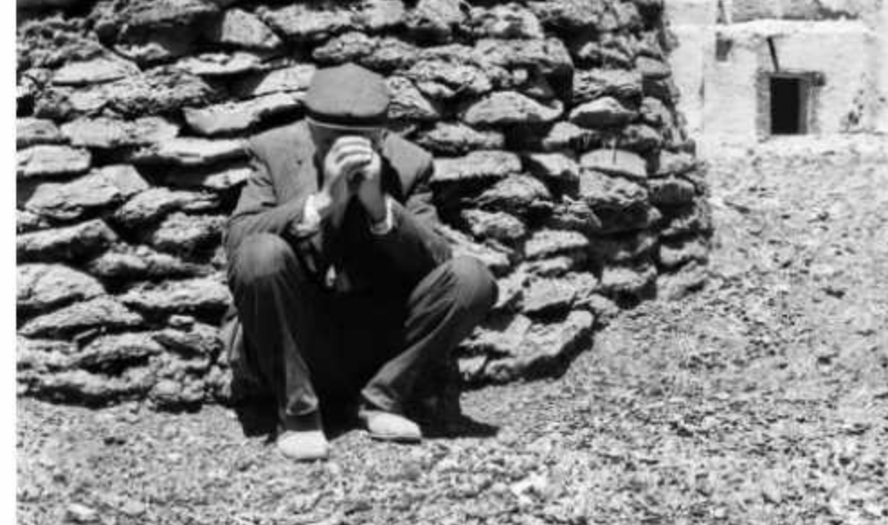
Anatolia Diaries, Approximately 3000 km in Anatolia – 1973

"Years of meeting and understanding Anatolian people"