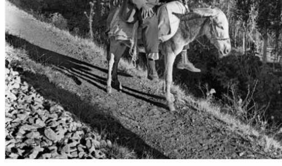
All images and text © Aydin Cetinbostanoglu