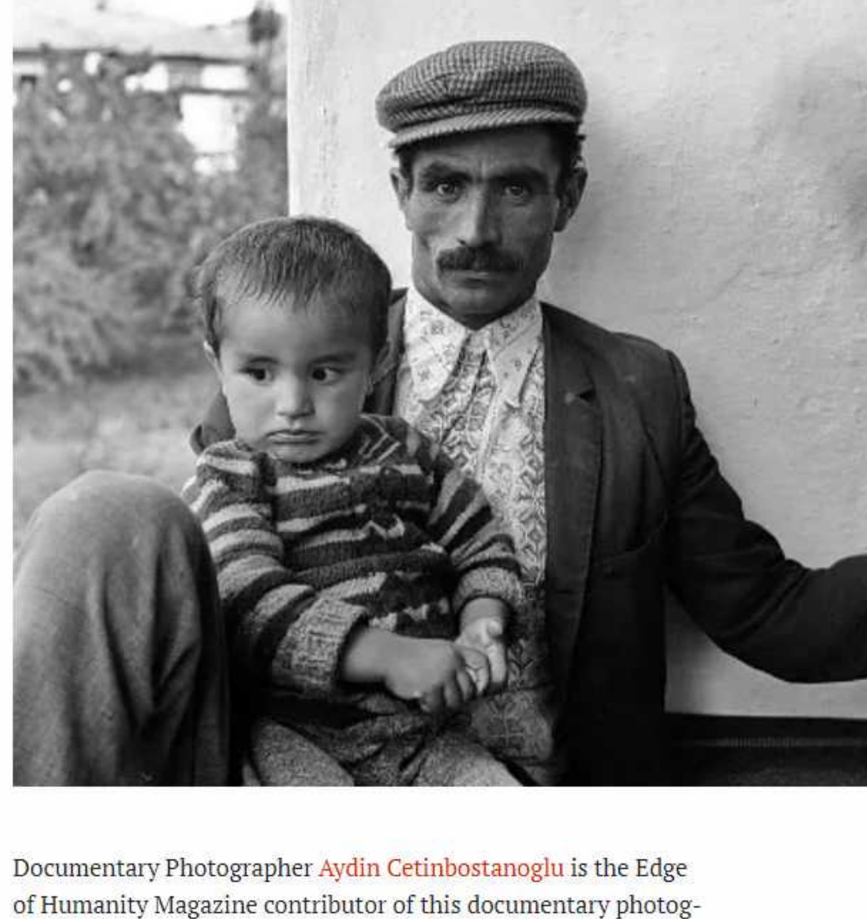
Documentary Photographer Aydin Cetinbostanoglu is the Edge of Humanity Magazine contributor of this documentary photography. From the project 'Anatolia Diaries'. To see Aydin's body of work, click on any image.

By Edge of Humanity Magazine, March 19, 2021