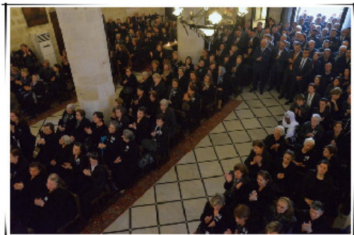
10. The church ceremony came to an end with a speech on his life.