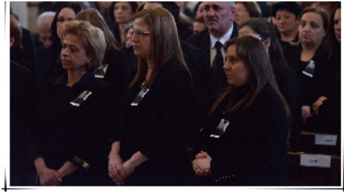
4. Everyone has a deep silence. They present their respects to the father who left a mark in their lives.

HPA Work Team WeChat 13261545182 TEL 8610-62252175 Sign Up Feedback English / 简体中文