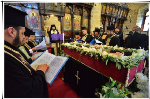
8. The church is once again packed with people. But this time, the congregation is here to pay their respects to their late Father.