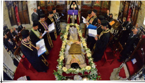
3. Funeral in the altar.