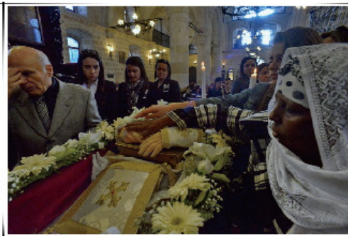
7. She is a refugee from Somalia. Antakya is the last stop of her long journey over from Africa.