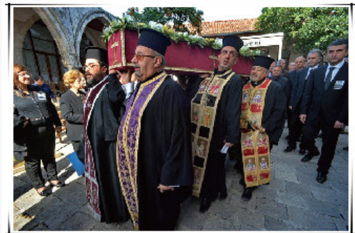
2. Priests carrying the coffin to the altar for the funeral ceremony.